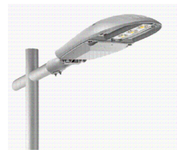
REF: 'A' LUMINAIRE