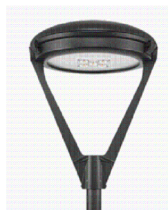
REF: 'B' LUMINAIRE