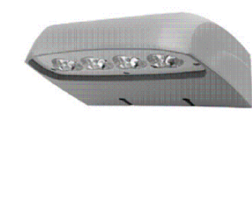
REF: 'C' LUMINAIRE