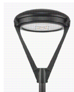
REF: 'D' LUMINAIRE